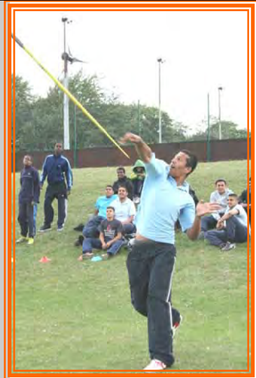
Morning Field Events